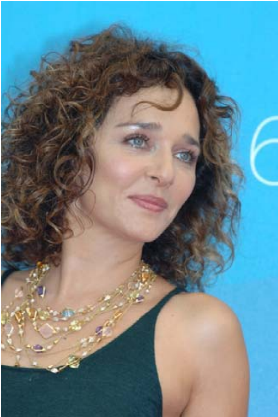
Giovanna – Valeria Golino