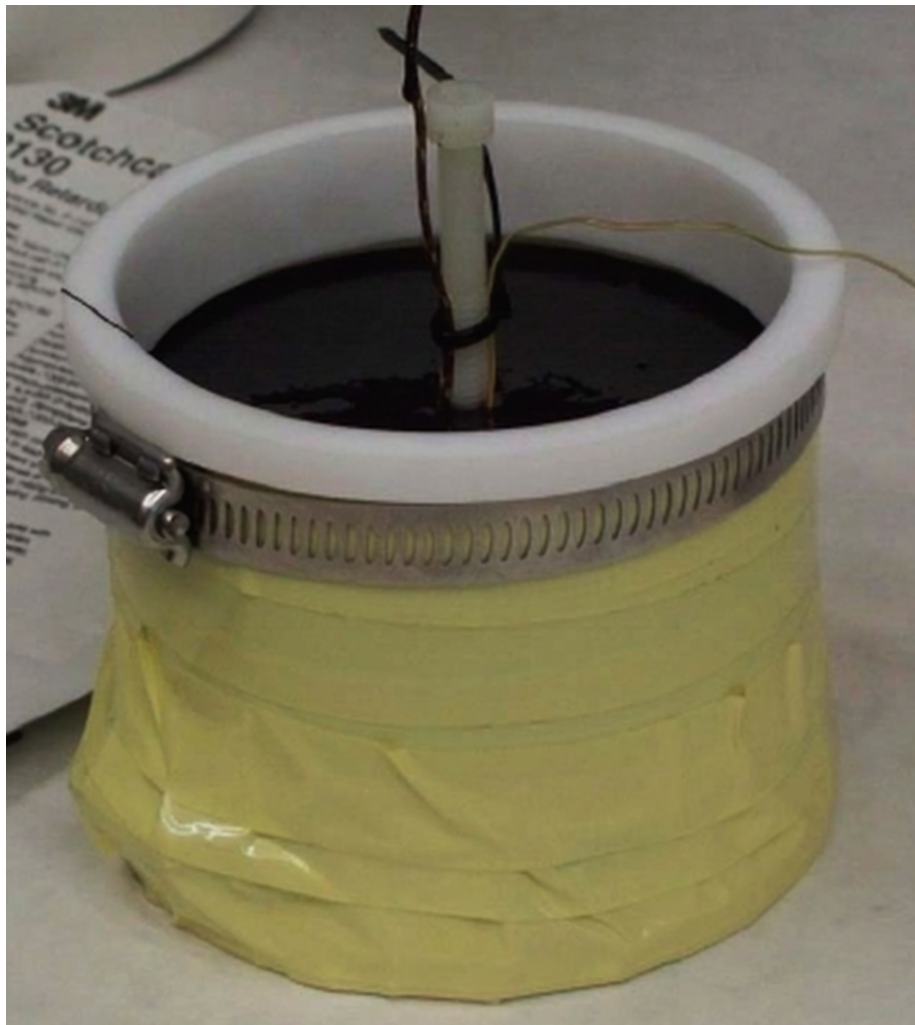
Figure 2: Figure 4