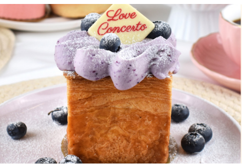
THE CUBE 7.95 Blueberry or raspberry (315 cal)