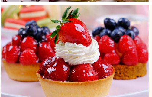
TARTE 9.75 Strawberries or berries (464 cal)