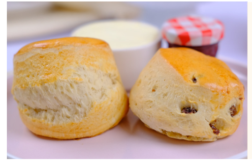
SCONES 7.45 A plain and a raisin with clotted\ cream\ \&\ strawberry preserves (349 cal)