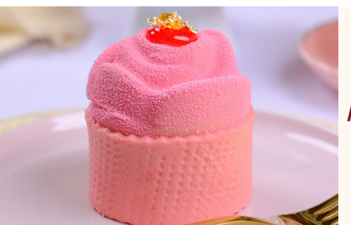
LOVE CONCERTO MOUSSE 9.75 Rose & raspberry mousse (191 cal)

Traditional recipe cheesecake with lemon (689 cal)