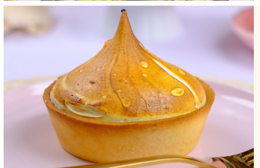
LEMON MERINGUE 8.75