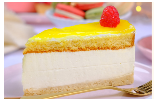
LEMON CHEESECAKE 8.95

Traditional recipe cheesecake with lemon (689 cal)