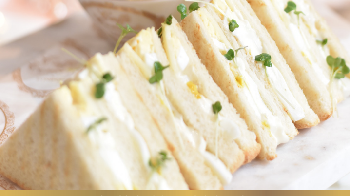
CLASSIC EGG MAYO & CHEESE