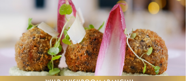
WILD MUSHROOM ARANCINI