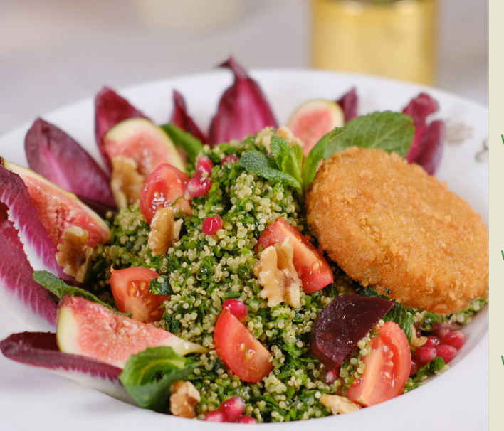
QUINOA TABBOULEH WITH FRITTELLE