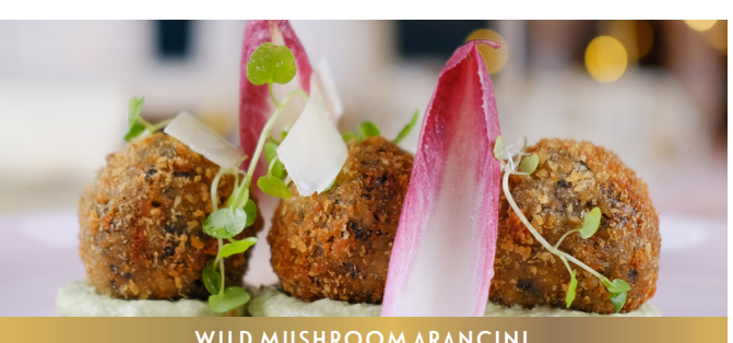
WILD MUSHROOM ARANCINI