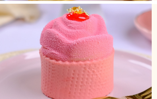
LOVE CONCERTO MOUSSE

Traditional recipe cheesecake with lemon (689 cal)