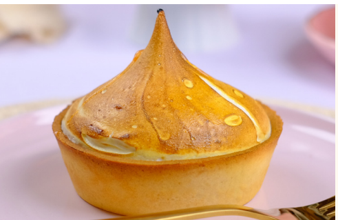
LEMON MERINGUE 8.45