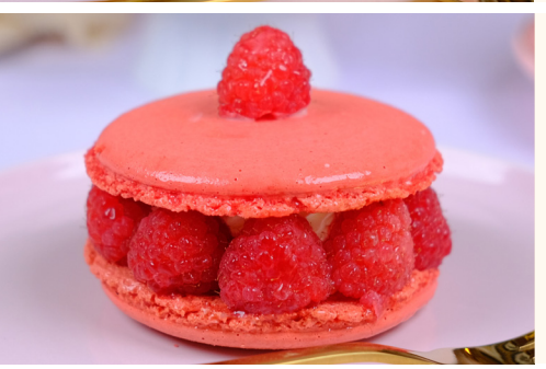
MACARON CAKE 9.45