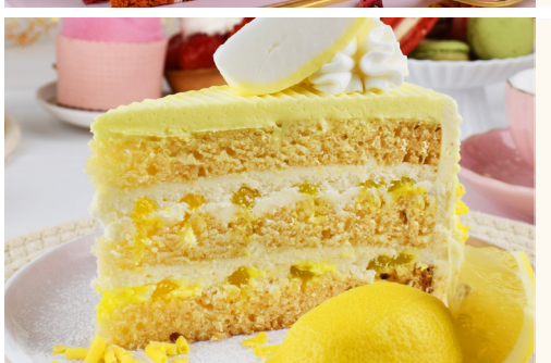
FROSTING CAKE 8.75