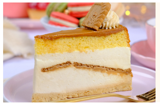
BISCOFF LOTUS CHEESECAKE 8.95