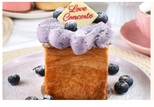
THE CUBE 7.45 Blueberry or raspberry (315 cal)