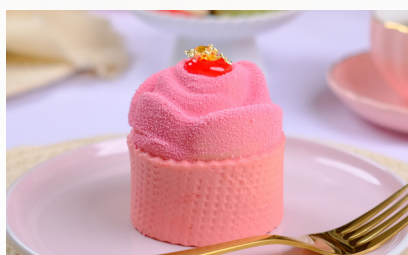
LOVE CONCERTO MOUSSE 8.45 Rose & raspberry mousse (191 cal)