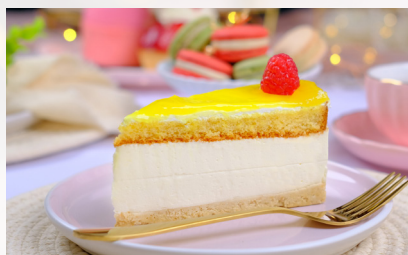
LEMON CHEESECAKE 7.95 Traditional recipe cheesecake with lemon (689 cal)