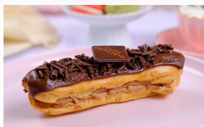
CHOCOLATE ÉCLAIR 6.95 🌿 (493 cal)