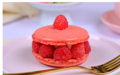
MACARON CAKE 8.75 🌿 (477 cal)