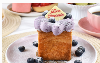
THE CUBE 6.95 Blueberry or raspberry (315 cal)