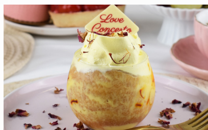
SAFFRON MILK CAKE 8.95 (580 cal)