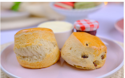
SCONES 5.95 A plain and a raisin with clotted cream & strawberry preserves (349 cal)