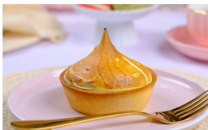
LEMON MERINGUE 7.95 🌿 (689 cal)