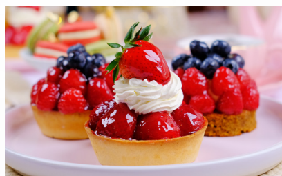
TARTE 8.65 Strawberries or berries (464 cal)