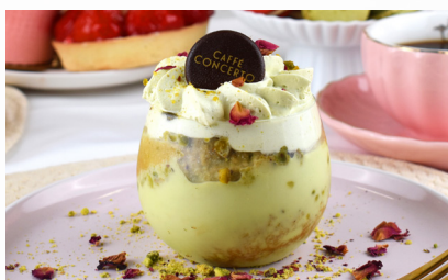
PISTACHIO DOLCE 8.95 🌿 (453 cal)