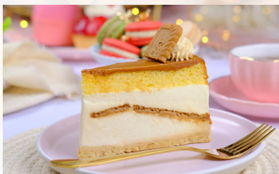
BISCOFF LOTUS CHEESECAKE 8.45 (655 cal)

A 9.5% discretionary optional charge will be added to your bill, which includes a 6.5% service charge. The additional 3% is a Hospitality Excellence Contribution, 100% of both dedicated to supporting our team.