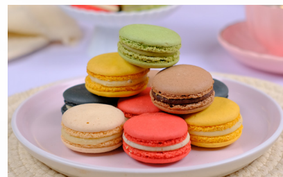
MACARONS 3 pieces 7.45 🌿 (197 cal)