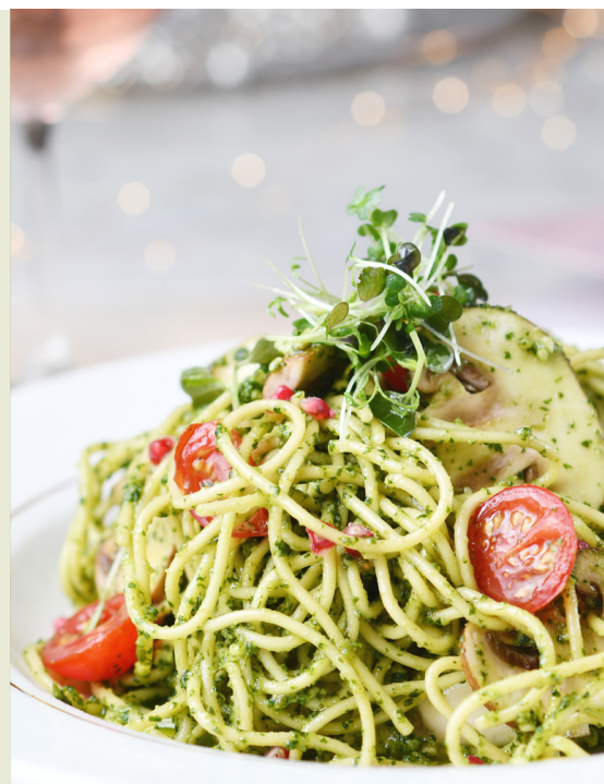
VEGAN PESTO SPAGHETTI

Spaghetti with our homemade vegan pesto. Crushed pine nuts, basil, mushroom, cherry tomato, spinach & vegan parmesan