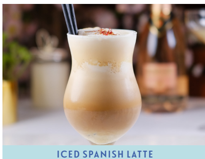
ICED SPANISH LATTE