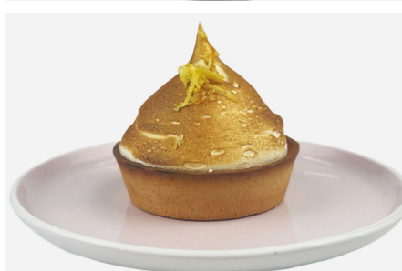
AMALFI LEMON MERINGUE 8.75 (689 cal) NEW