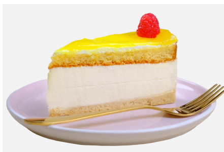
LEMON CHEESECAKE 8.95 Traditional recipe cheesecake with lemon (689 cal)