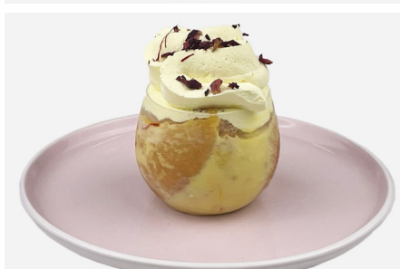
SAFFRON MILK CAKE 9.75 (580 cal)