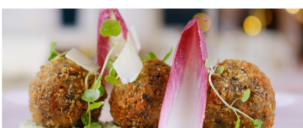
WILD MUSHROOM ARANCINI