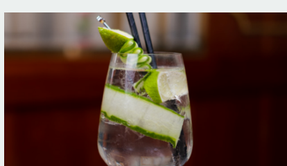
GIN & TONIC