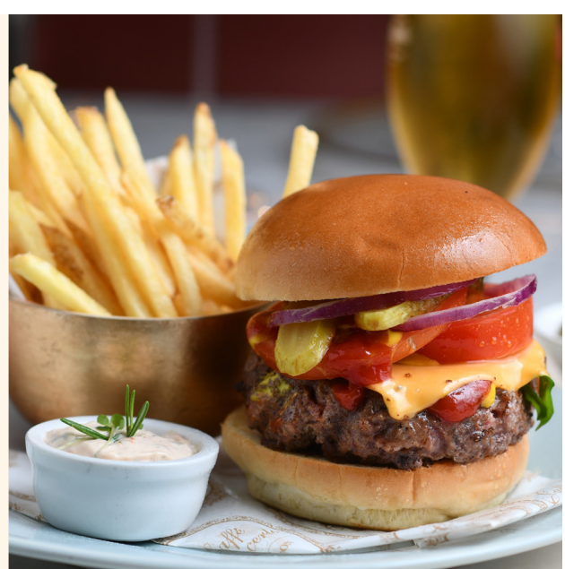
CONCERTO BEEF BURGER

100% 8oz beef, lettuce, tomatoes, American cheese, red onions, pickles & concerto sauce