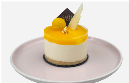
MANGO MOUSSE 9.25 (698 cal) NEW