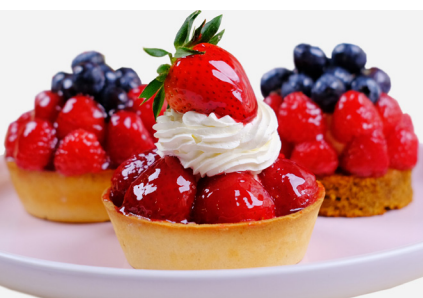
TARTE 9.75 Strawberries or berries (464 cal)