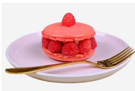
MACARON CAKE 9.75 (477 cal)