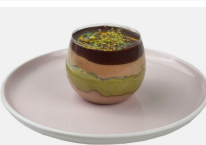
DUBAI CHOCOLATE 9.95 (622 cal) NEW