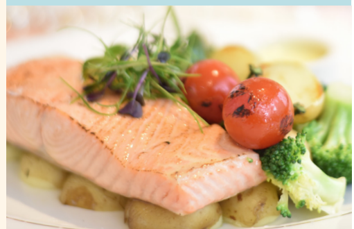
GRILLED SALMON STEAK