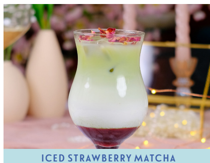
ICED STRAWBERRY MATCHA