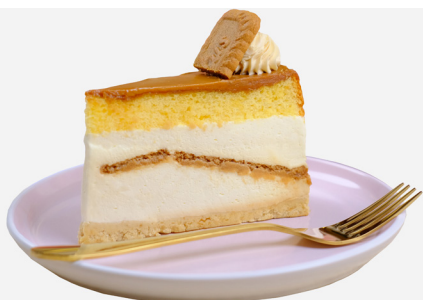
BISCOFF LOTUS CHEESECAKE 8.95 (655 cal)