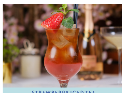
STRAWBERRY ICED TEA

Dishes may contain Allergens! We can't guarantee our dishes are allergen free. If you have any dietary requirements, please speak to a member of staff. Please scan the QR code for full dietary information.