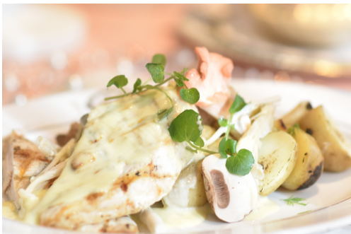
GRILLED CHICKEN BREAST