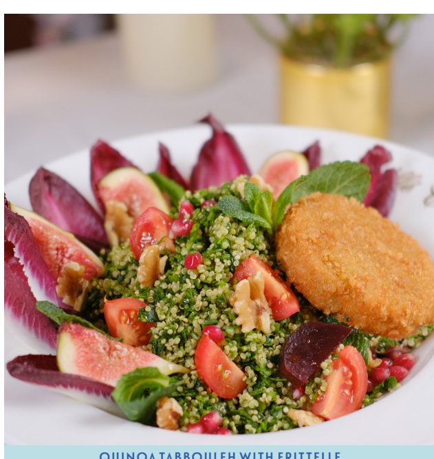
QUINOA TABBOULEH WITH FRITELLE