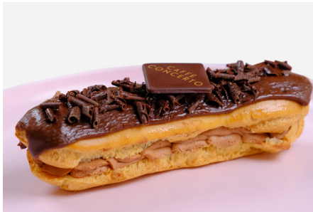
CHOCOLATE ÉCLAIR 7.65 (493 cal)

A 13.5% discretionary optional charge will be added to your bill, which includes a 6.5% service charge. The additional 7% is a Hospitality Excellence Contribution, 100% of both dedicated to supporting our team. Calorie information is calculated using typical values and measures. All calories detailed are per portion unless otherwise stated.