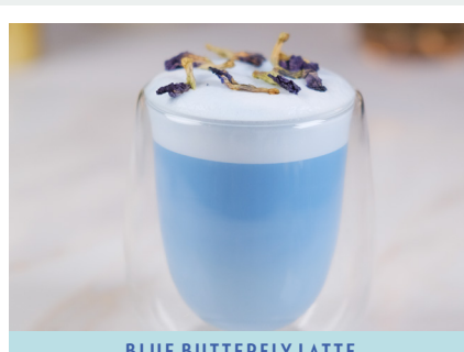
BLUE BUTTERFLY LATTE