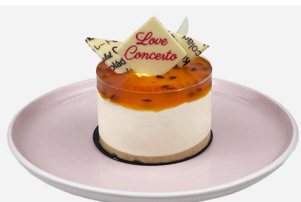
PASSION FRUIT CHEESECAKE 9.25 (703 cal) NEW