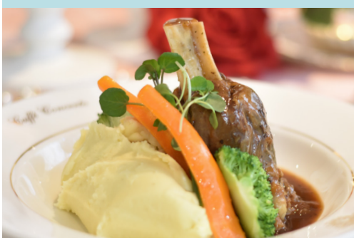
BRAISED LAMB SHANK

With a creamy mushroom sauce served with sautéed baby potatoes, green beans & roasted vine cherry tomatoes