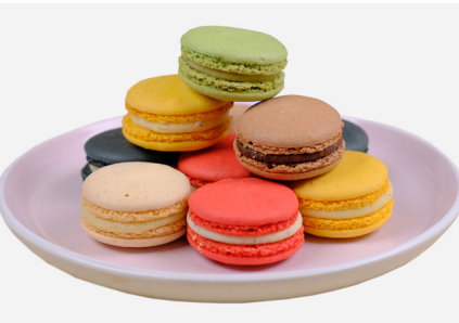
MACARONS 3 pieces 8.75 (197 cal)