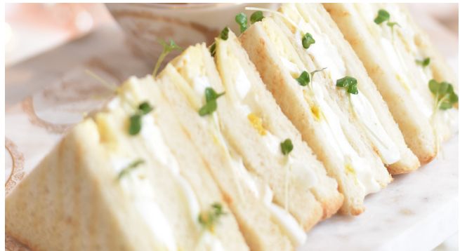
CLASSIC EGG MAYO & CHEESE

OPEN SMOKED SALMON (851 cal) 21.95 With soft cheese, fresh dill & capers