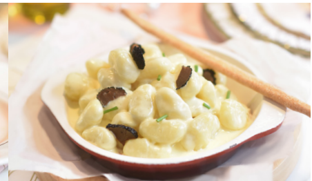
GNOCCHI FOUR CHEESE & TRUFFLE OIL