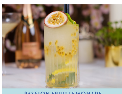
PASSION FRUIT LEMONADE