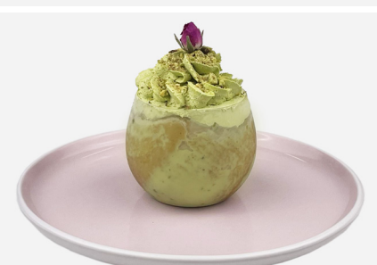
PISTACHIO DOLCE 9.95 (453 cal)