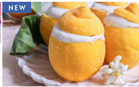
AMALFI LEMON SORBET (344 cal) 11.95

MUFFIN Chocolate, berries or caramel 4.75 PALMIERS 4.35 FRANGIPANE Cherry or apple almond & cinnamon 6.95 NEW YORK ROLL Pistachio, hazelnut or chocolate 6.95