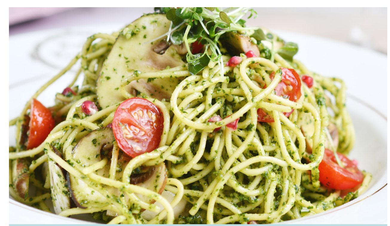
VEGAN PESTO SPAGHETT