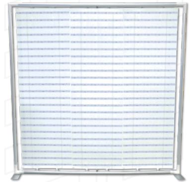
Add backlighting for increased impact

Go from one target market to another using the same frame hardware and different graphics