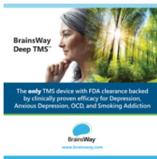
Graphic (Backlit Material)