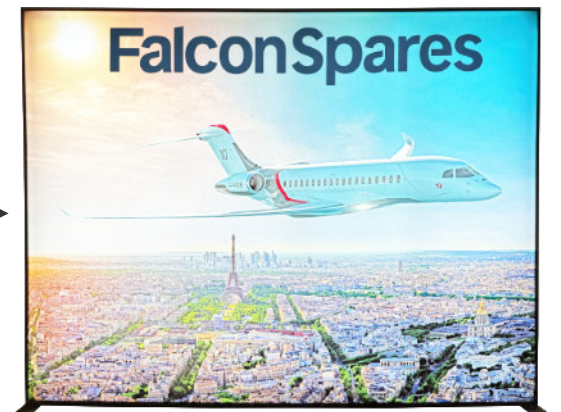
117x91" from March 2024