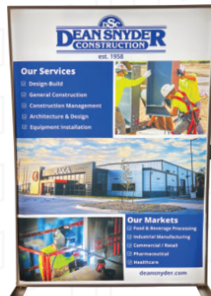
64x91" Recruiting Display

Go from one target market to another using the same frame hardware and different graphics