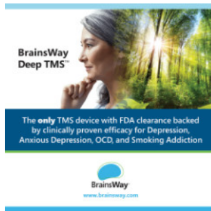
Graphic (Non-Backlit Material)