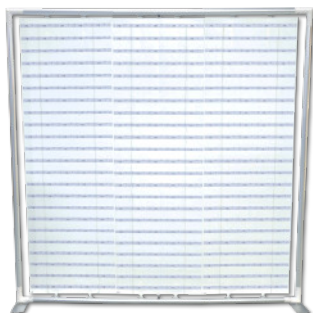
Frame with Lights