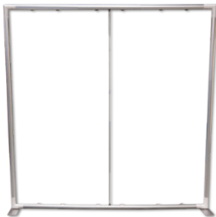
Frame (no Lights)