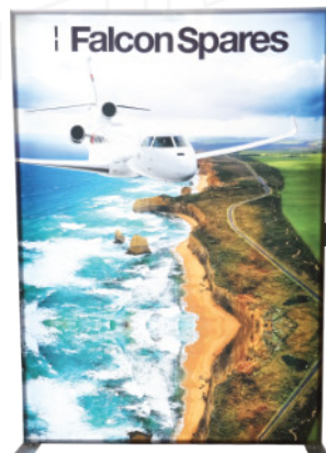
64x91" from January 2020

Expand your display as your business grows, using the components you already own