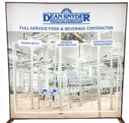
91x91" Trade Show Display

Expand your display as your business grows, using the components you already own