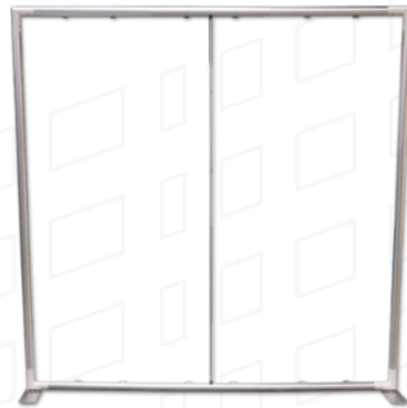
91x91" Frame without Lights

Add backlighting to increase impact and lead count by 50% or more