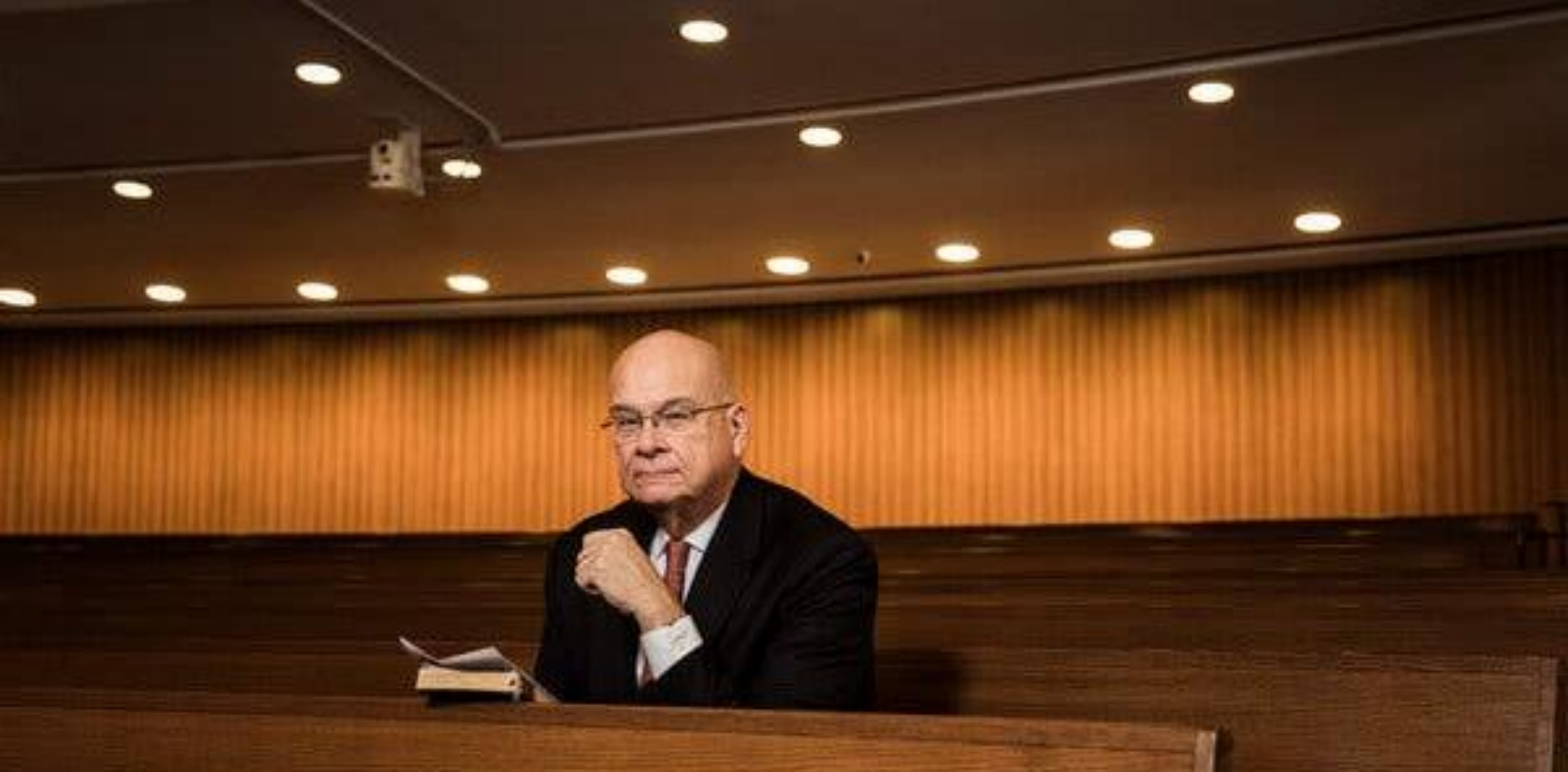
Timothy Keller: Chairman and co-founder of Redeemer City to City Pioneering Manhattan Evangelist, went to be with Jesus at 72.