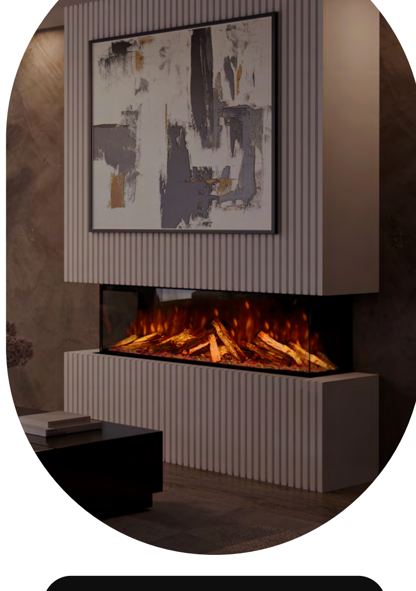
PANORAMIC S 1000