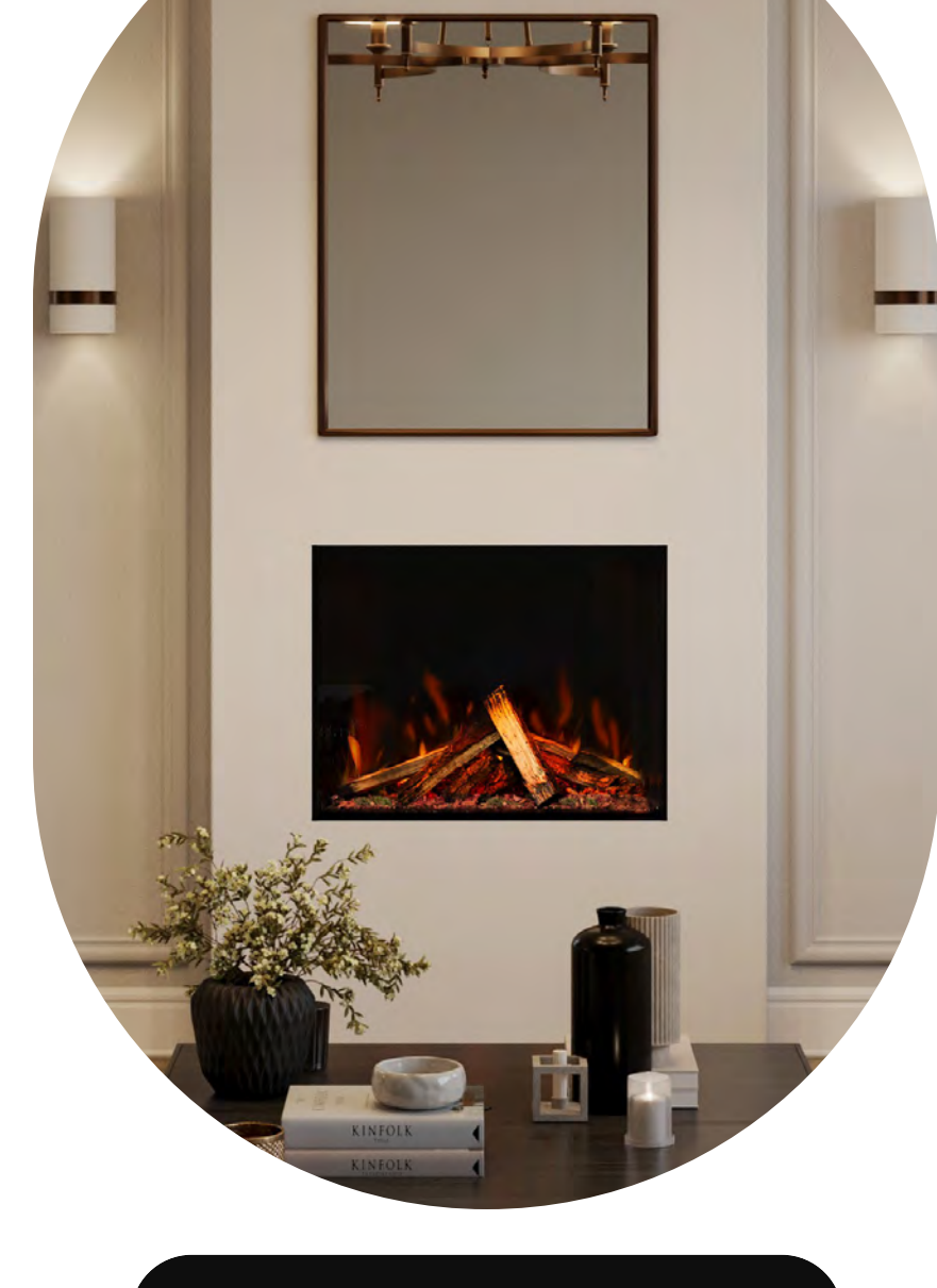
PANORAMIC S 700