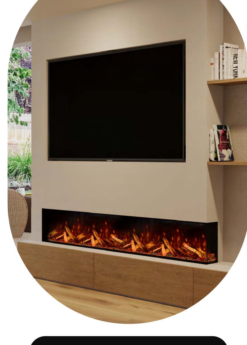
PANORAMIC S 2000