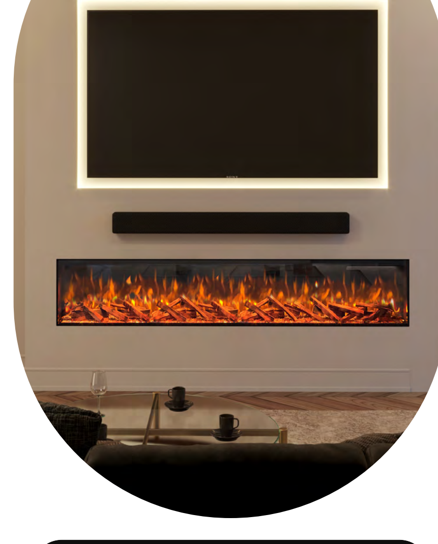
PANORAMIC 3DP 2000