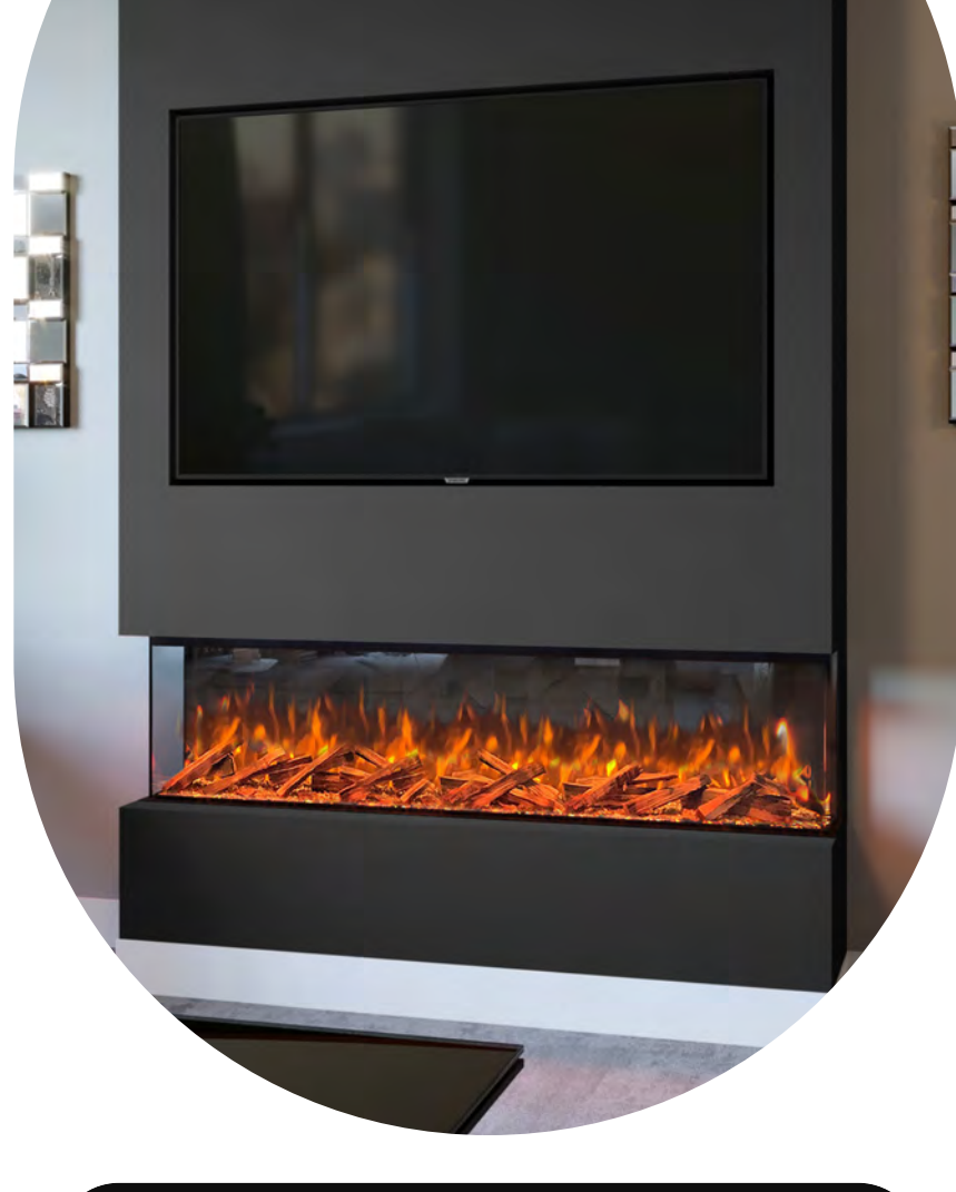
PANORAMIC 3DP 1500