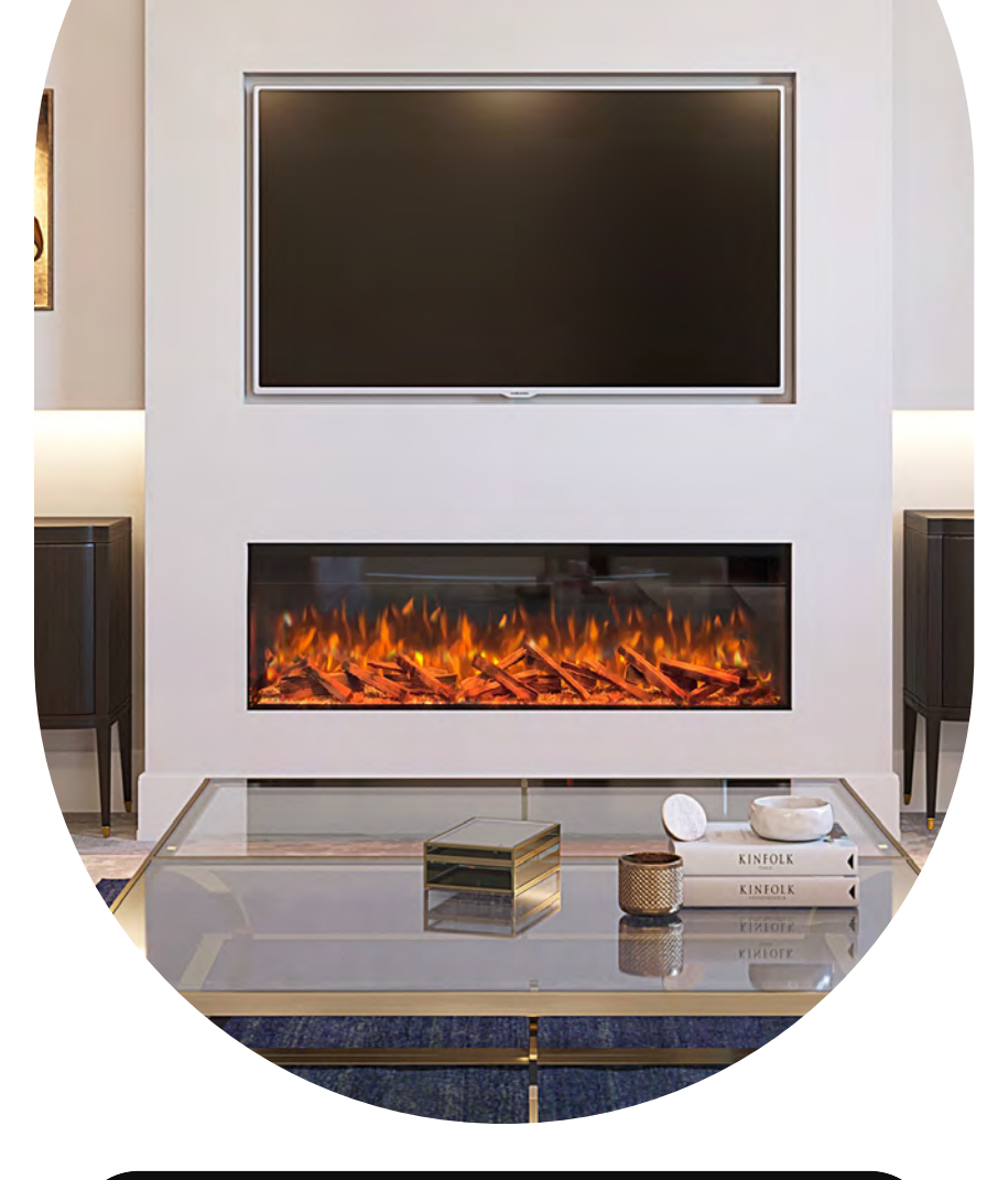
PANORAMIC 3DP 1250