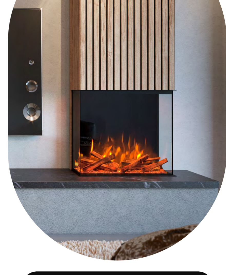
PANORAMIC 3DP 700