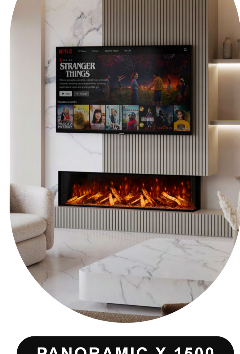
PANORAMIC X 1500