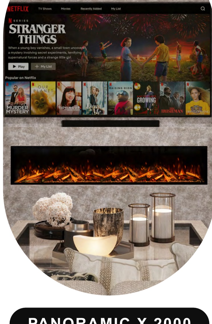
PANORAMIC X 2000