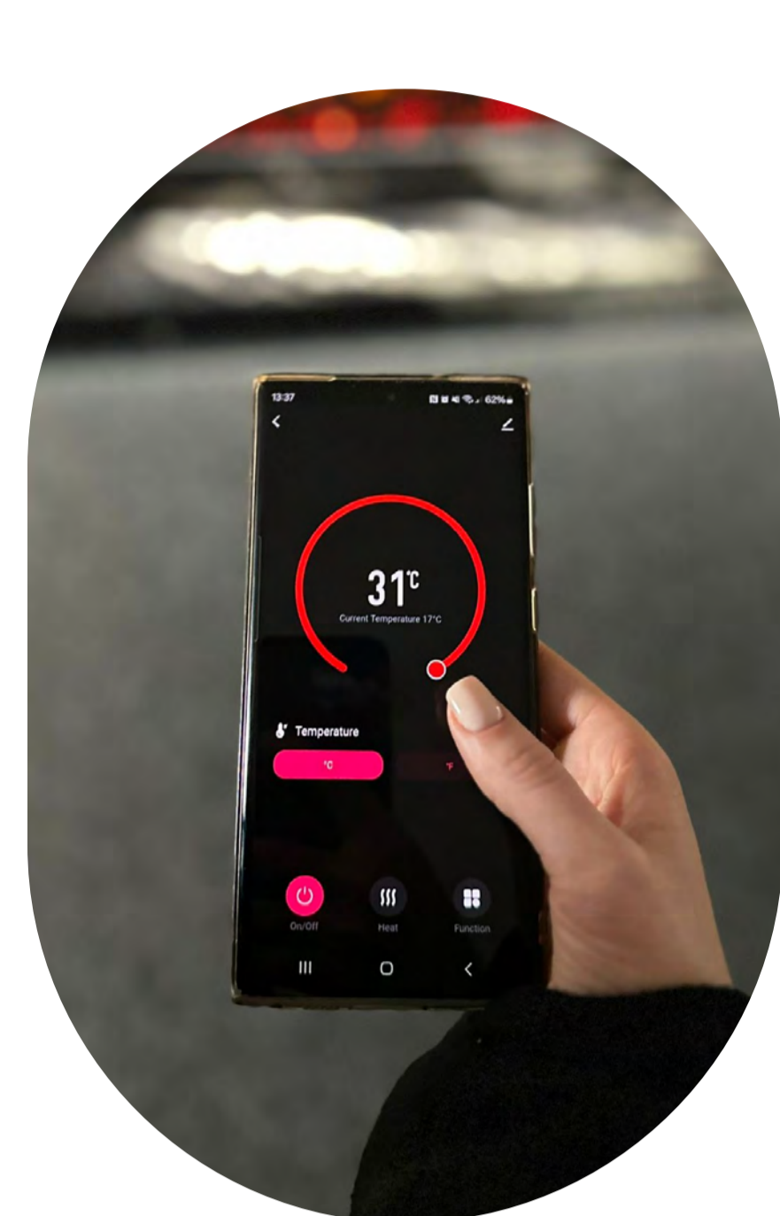
SMART APP & ALEXA