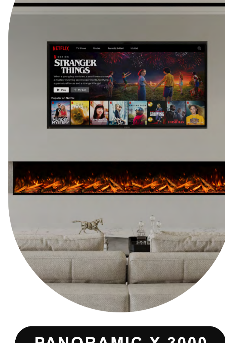
PANORAMIC X 3000